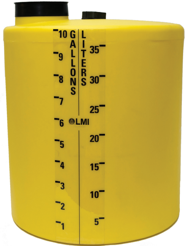
Model No. 27421 Tank Assembly (Pump must be ordered separately.)