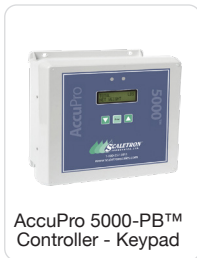
AccuPro 5000-PB™ Controller - Keypad