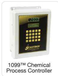
1099™ Chemical Process Controller