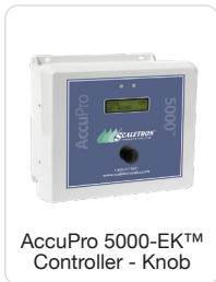
AccuPro 5000-EK™ Controller - Knob