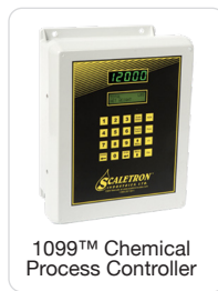
1099™ Chemical Process Controller