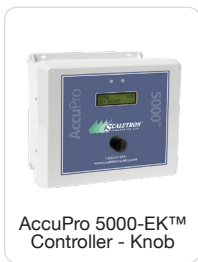
AccuPro 5000-EK™ Controller - Knob