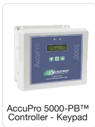
AccuPro 5000-PB™ Controller - Keypad