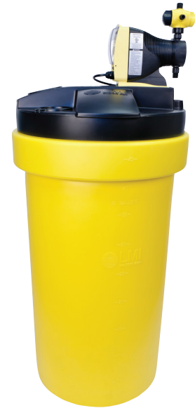
Model No. 26350