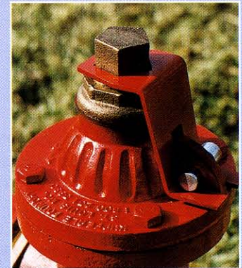
LOCKING WRENCH OPTION