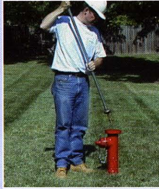
PULL OUT ROD