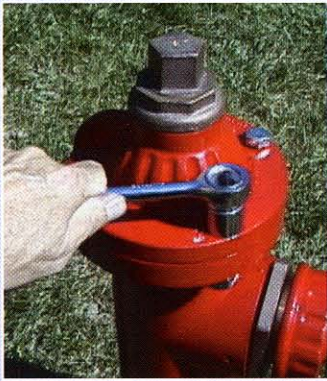
UNDO 4 BOLTS