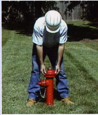
PULL UP TOP CAP