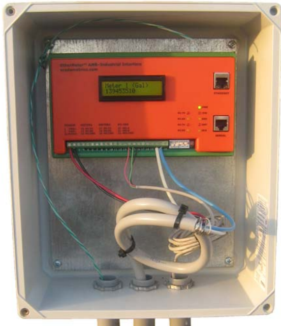
EtherMeter installation is simple and compact.

As an added benefit, the EtherMeter is equipped with 4 auxiliary inputs and outputs, making it suitable for deployment as a standalone RTU at low-complexity locations, such as master meter vaults or even simple pumping stations.