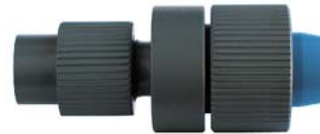
3/8" PE Tubing Adaptor